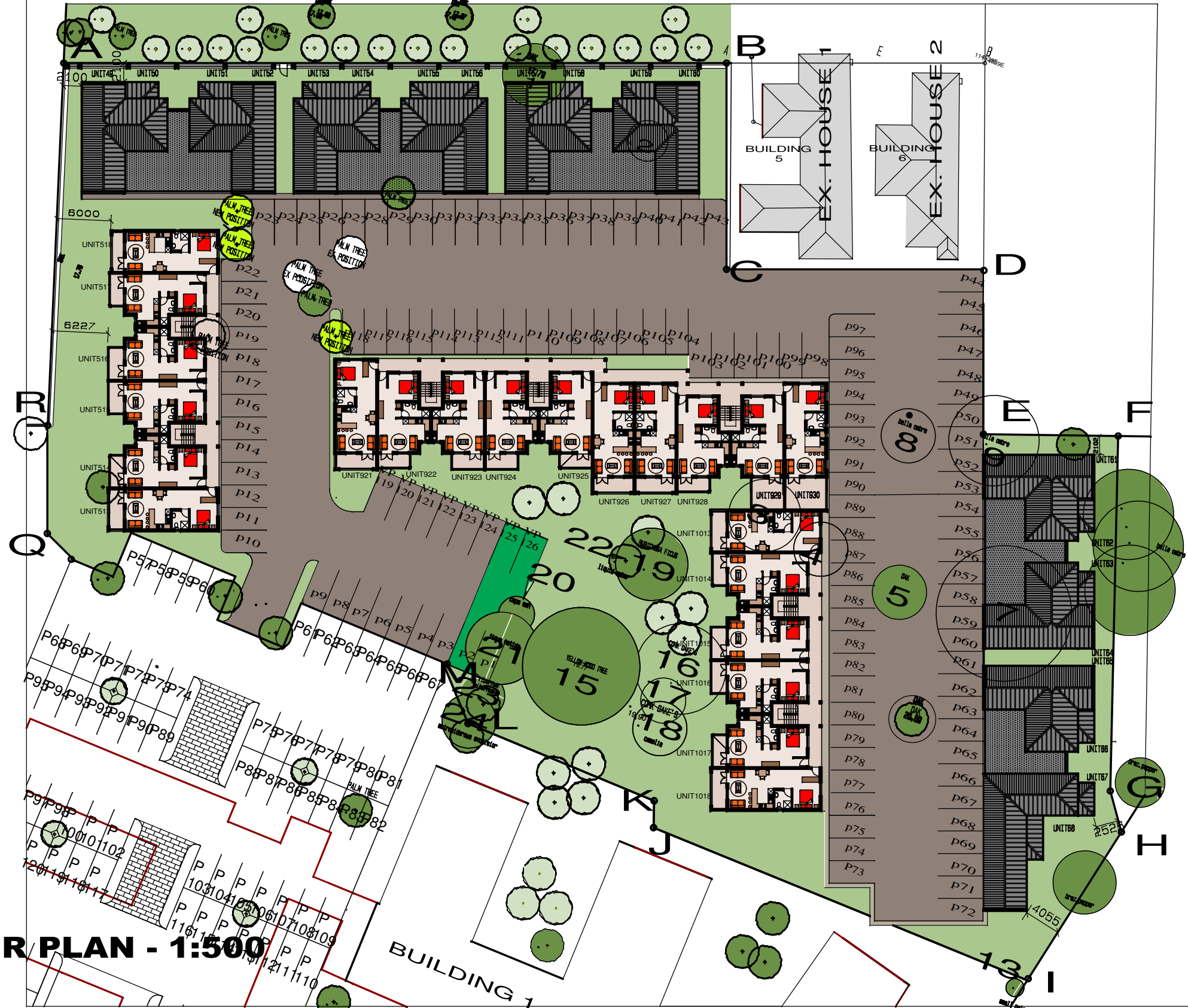
SECOND FLOOR PLAN - 1:500