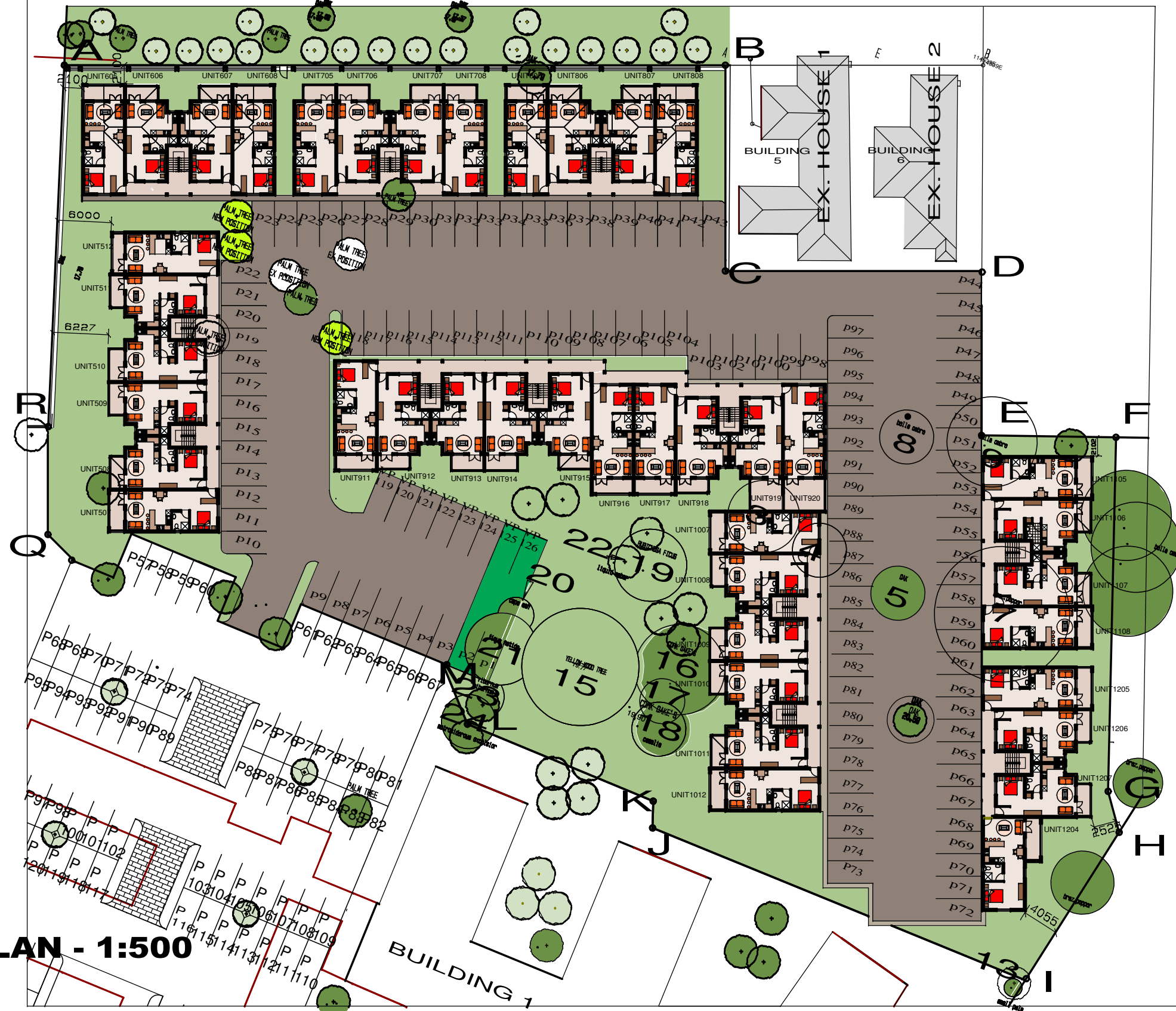
1ST FLOOR PLAN - 1:500